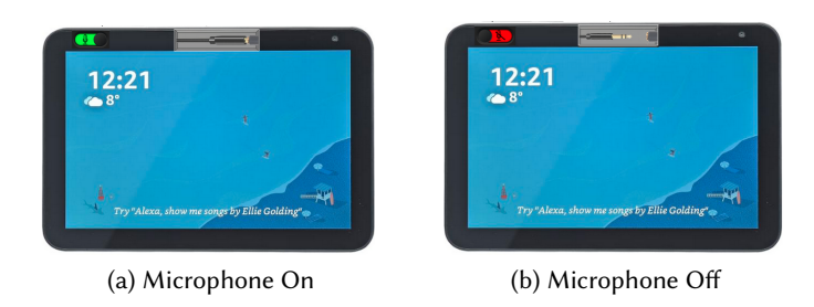
Fig. 1. Prototype with physical control and physical feedback

Physical Control & LED Feedback. This prototype (Fig 2) provides a physical hardware based on-off button to control (turn on and off) the microphone. However, for feedback, this prototype uses an LED to communicate the current status of the microphone. For example, when the LED is flashing green, it means the microphone is 'on' and when the LED is flashing red, it indicates the microphone is 'off'.