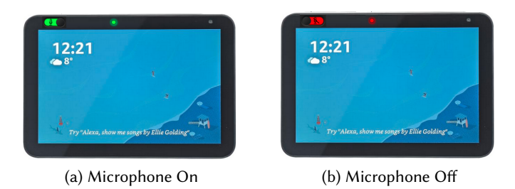
Fig. 2. Prototype with physical control and LED feedback

Physical Control & LED Feedback. This prototype (Fig 2) provides a physical hardware based on-off button to control (turn on and off) the microphone. However, for feedback, this prototype uses an LED to communicate the current status of the microphone. For example, when the LED is flashing green, it means the microphone is 'on' and when the LED is flashing red, it indicates the microphone is 'off'.