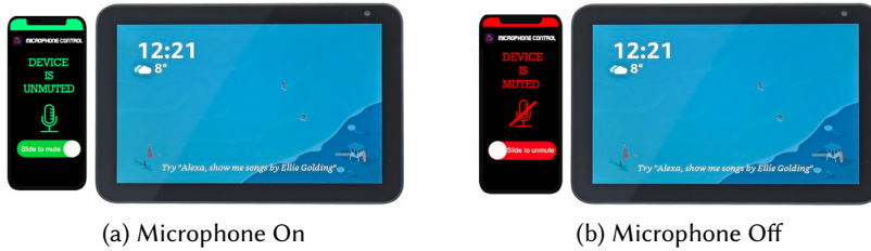
Fig. 3. Prototype with software based control and feedback mechanism.

Physical Control & Software Feedback. The prototype provides a physical hardware based on-off button to control (turn on and off) the microphone. The software based feedback is provided using a mobile app. Whenever the microphone's status changes, the user can see the notification on their mobile app in the form of a textual description of the microphone's current status. Different colors are used to indicate different statuses of the microphone. The choice of colors was grounded in a prior study by Ahmad et al. [5] – green was used to indicate the 'on' state, while red was used to indicate the 'off' state.