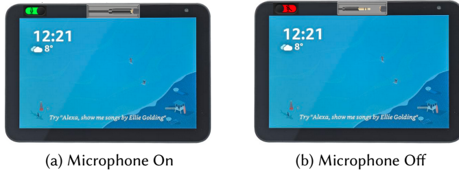
Fig. 1. Prototype with physical control and physical feedback

Physical Control & LED Feedback. This prototype (Fig 2) provides a physical hardware based on-off button to control (turn on and off) the microphone. However, for feedback, this prototype uses an LED to communicate the current status of the microphone. For example, when the LED is flashing green, it means the microphone is ‘on’ and when the LED is flashing red, it indicates the microphone is ‘off’.