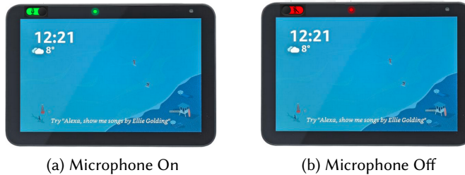
Fig. 2. Prototype with physical control and LED feedback

Physical Control & LED Feedback. This prototype (Fig 2) provides a physical hardware based on-off button to control (turn on and off) the microphone. However, for feedback, this prototype uses an LED to communicate the current status of the microphone. For example, when the LED is flashing green, it means the microphone is ‘on’ and when the LED is flashing red, it indicates the microphone is ‘off’.