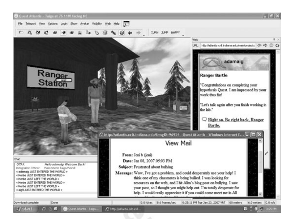
Figure 2. Screen capture from the Taiga virtual world.

NPC presents simulated dialogues that reveal a perspective on the problem. Drawing on these conversations, students report profiles of each group of users of the park and how they might relate to the fish problem (Quest One). Next, they collect and analyze data to develop an assertion about the causes of the problem (Quest Two) in order to propose informed solutions (Quest Three).