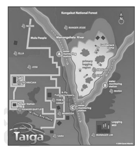
Figure 3. A 2D map of the Taiga park.

their help. They then log in and navigate their avatar through the 3D environment, clicking on virtual characters who share information. For example, in the beginning of the simulation after clicking on Lim, the logging mill manager, the students respond to a dialogue tree, and Lim's follow-up response is based on choices made by the student in the dialogue tree: