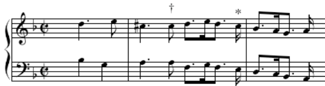
Fig. 1. Purcell: The Epicure (based on the manuscript)