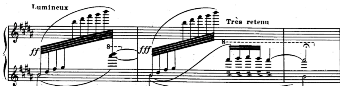
Fig. 10. Debussy: Les Collines d'Anacapri , final measures (Durand ed.)