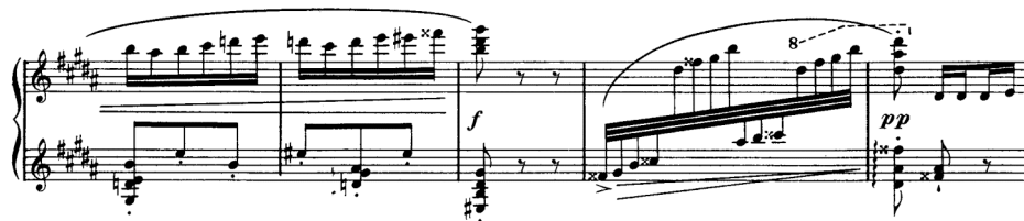
Fig. 7. Ravel: Gaspard de la Nuit, Scarbo , mm. 90-94 (Durand ed.)